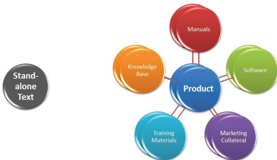
Figure 3: Product-centric translation, where a text to be translated is not only connected to a product, but to earlier versions of the same text, earlier versions of the product, and other texts that are connected to the same product, as well as earlier versions of those other texts. These relationships that are typical for technical translation projects raise a variety of consistency issues, which are absent from the translations of stand-alone/literary texts.

The competencies and processes outlined in standards like ISO 17100 can be used as a roadmap for (re-) orienting their curriculum and faculty—not to mention internship—development efforts.